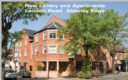
New Library and Apartments London Road Alderley Edge