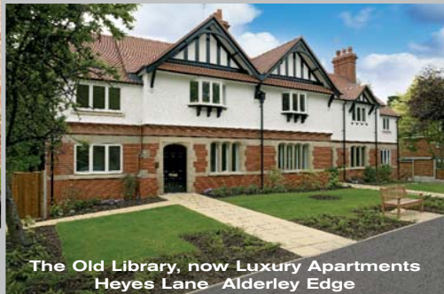
The Old Library, now Luxury Apartments Heyes Lane Alderley Edge