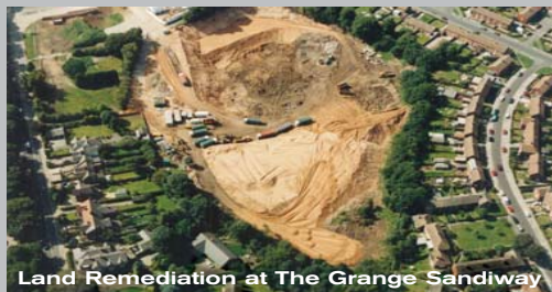
Land Remediation at The Grange Sandiway

Virtually all new Jones homes are now constructed on brownfield sites. The expertise gained in this area has led to the formation of a specialist company, Land Reclamation and Development Ltd, to expand these opportunities further. Working closely with expert consultants it is able to satisfy the most stringent requirements and to achieve certification from the environmental bodies and the NHBC. A good example is The Grange development at Sandiway, Cheshire, which is the largest remediation project of its type using funding from the Landfill Tax Credit Scheme. Such abilities have enabled the Company to create development opportunities in desirable locations. Elsewhere at Moston in East Manchester a development of 278 homes will occupy 20 acres of a former factory site. This project required extensive demolition and land remediation and is a good example of the Company's contribution and commitment to bringing regeneration to this part of the city. In addition the development is fulfilling its promise to raise the profile of the general area and support local property values.