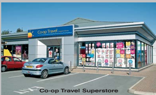
Co-op Travel Superstore

The former ground of Bolton Wanderers Football Club is now a landmark retail scheme owned by Grangefern Properties, a joint venture between Orbit Developments and United Co-operatives Limited.