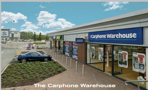
The Carphone Warehouse