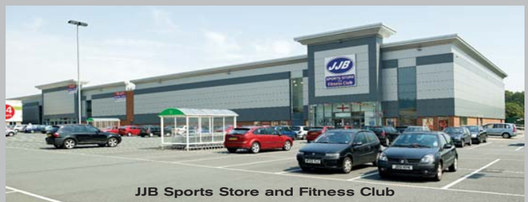
JJB Sports Store and Fitness Club

Occupiers now include ASDA, JJB Sports Retail and JJB Fitness Clubs, Co-op Travel, Subway, Johnsons the Cleaners and Carphone Warehouse and the next stage is a development site which benefits from a planning approval for a 10,000 sq ft car showroom.